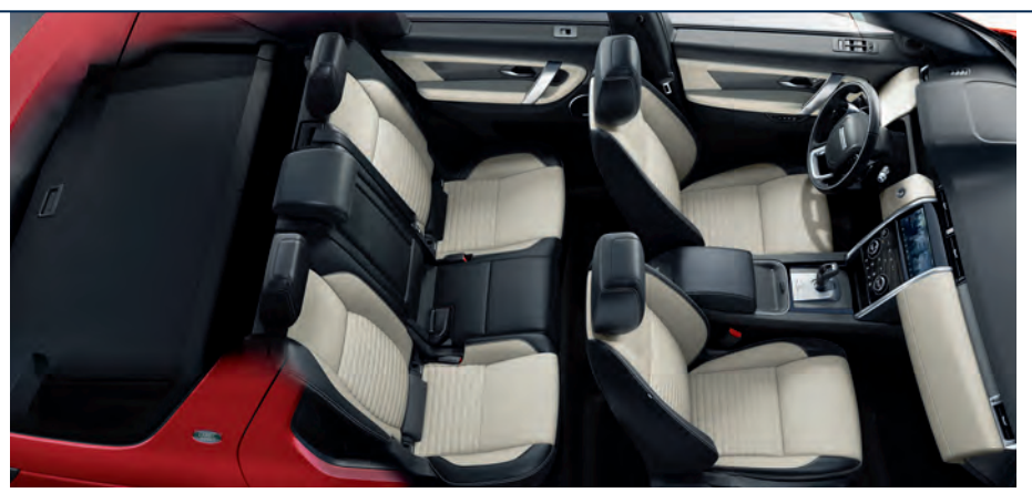
Interior shown: Light Oyster/Ebony Grained leather seats with Light Oyster stitch and Titanium Mesh trim finisher.