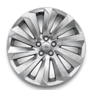
19" 10 SPOKE 'STYLE 1039' SILVER