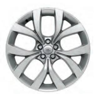
20" 5 SPLIT SPOKE 'STYLE 5076' SILVER