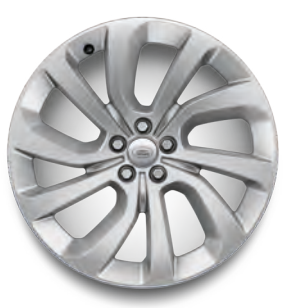
20" 5 SPLIT SPOKE 'STYLE 5089' SILVER