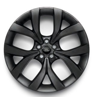
20" 5 SPLIT SPOKE 'STYLE 5076' SATIN DARK GREY