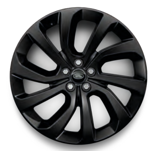
20" 5 SPLIT SPOKE 'STYLE 5089' GLOSS BLACK