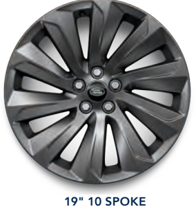
19" 10 SPOKE 'STYLE 1039' SATIN DARK GREY