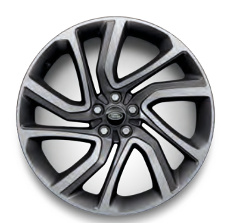
21" 5 SPLIT SPOKE 'STYLE 5090' GLOSS BLACK & CONTRAST DIAMOND