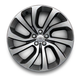
20" 5 SPLIT SPOKE 'STYLE 5089' GLOSS BLACK & CONTRAST DIAMOND TURNED