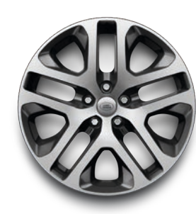
20" STYLE 5095, 5 SPLIT-SPOKE GLOSS DARK GREY WITH CONTRAST DIAMOND TURNED