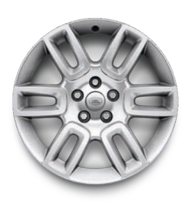
19" STYLE 6010, 6 SPOKE GLOSS SPARKLE SILVER