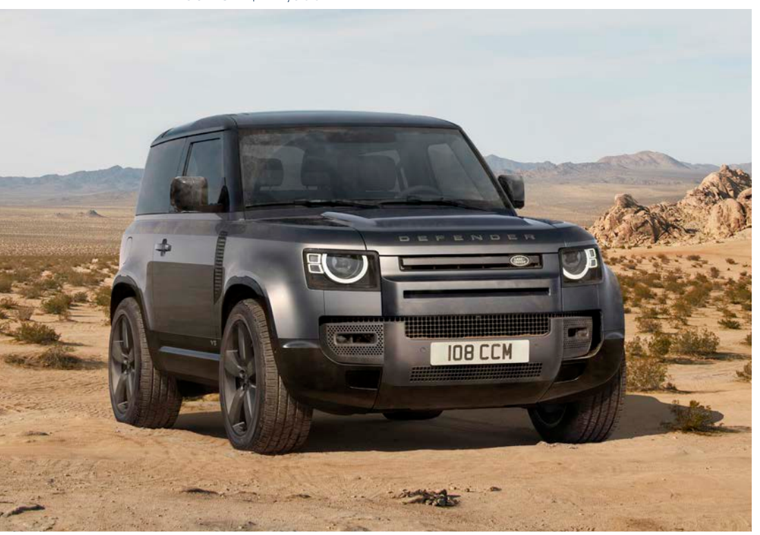
DEFENDER 90 V8 - $214,900