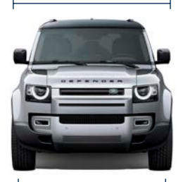
Front wheel track Air suspension 1,706mm Coil suspension 1,704mm

Width 2.008mm mirrors folded Width 2.105mm mirrors out