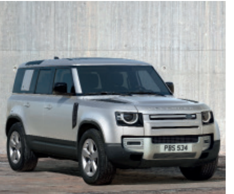
DEFENDER 110 X - $172,900