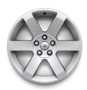
19" STYLE 6009, 6 SPOKE GLOSS SPARKLE SILVER