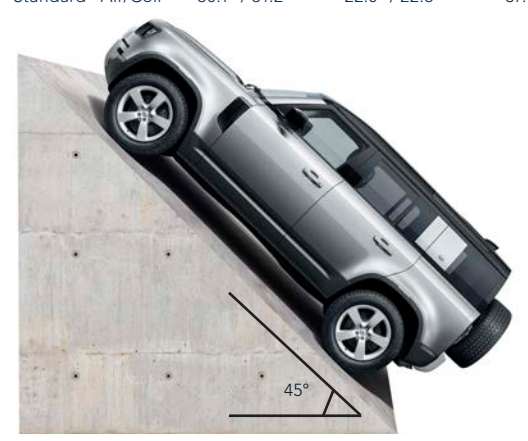
Departure Angle 40.0° / 37.5° 37.7° / 37.8°