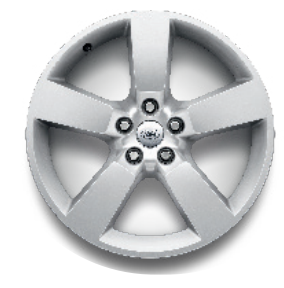
20" STYLE 5098, 5 SPOKE TITAN SILVER