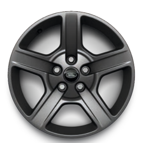
20" STYLE 5094, 5 SPOKE SATIN DARK GREY

Configure your Defender at www.landrover.co.nz