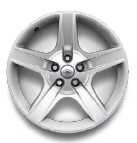
20" STYLE 5094, 5 SPOKE GLOSS SPARKLE SILVER