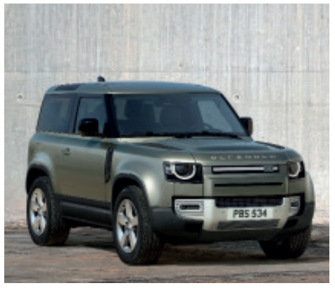
DEFENDER 90 X - $167,900