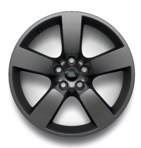
20" STYLE 5098, 5 SPOKE SATIN DARK GREY