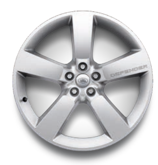
22" STYLE 5098, 5 SPOKE GLOSS SPARKLE SILVER All-season tyres