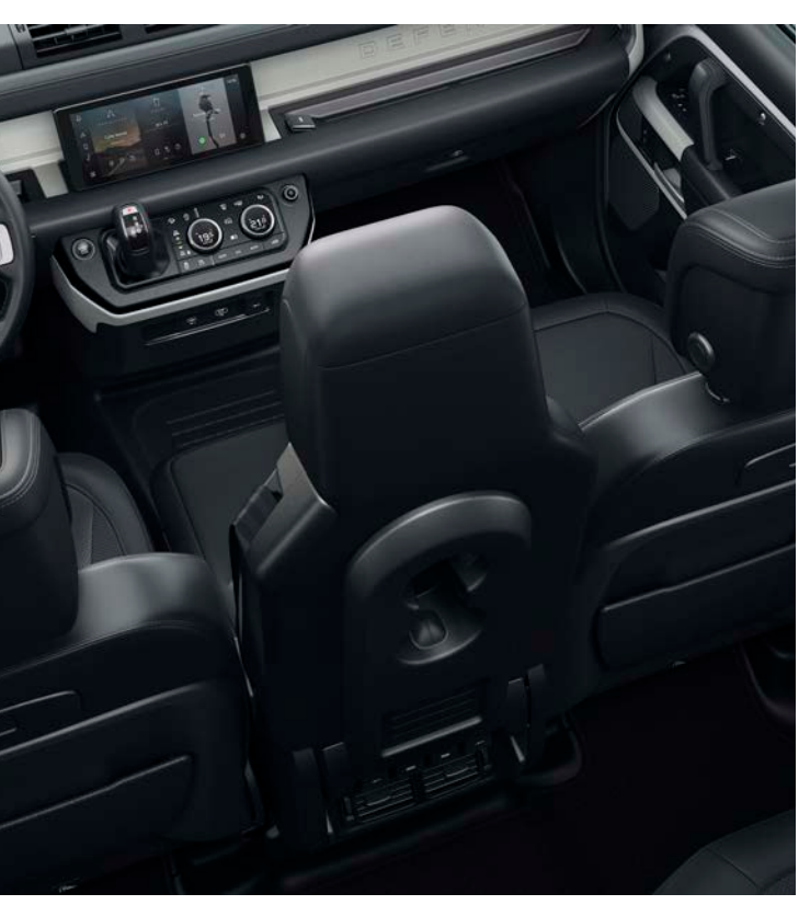
FRONT JUMP SEAT