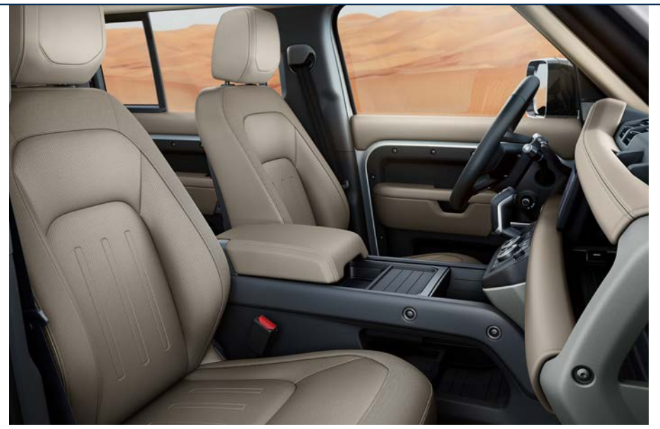
ACORN/LUNAR - Interior shown is Acorn grained leather and Lunar interior with cross car beam in Light Grey Powder Coat Brushed finish.