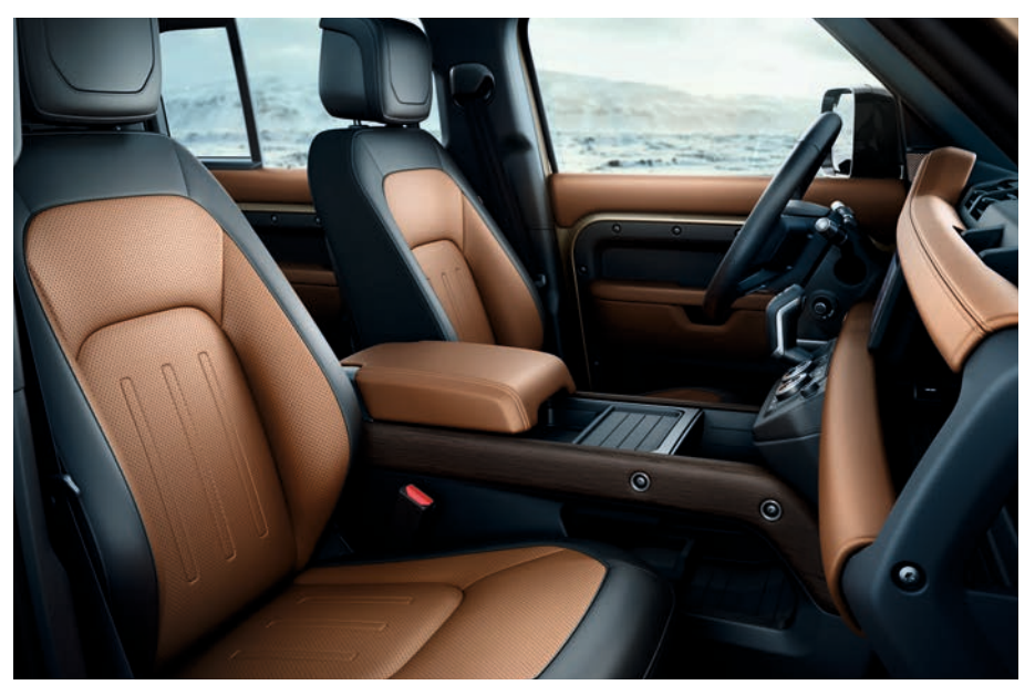
VINTAGE TAN/EBONY (Defender X Only) - Interior shown is Vintage Tan/Ebony Windsor leather and Steel-cut premium textile seats and Ebony interior with cross car beam in Dark Grey Powder Coat Brushed finish.