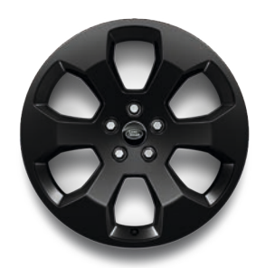
20" STYLE 6011, 6 SPOKE GLOSS BLACK All-season tyres