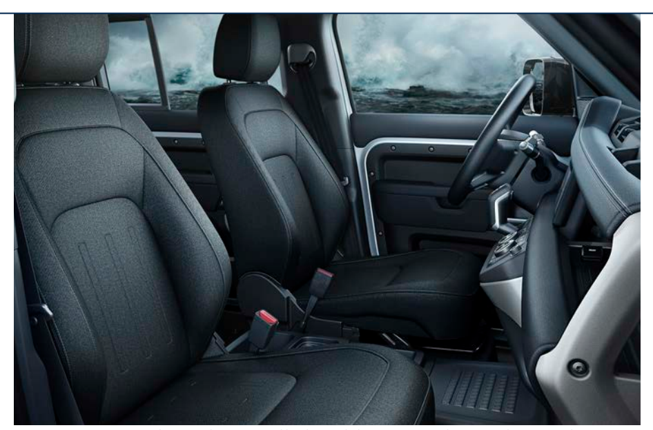
EBONY/EBONY - Interior shown is Ebony grained leather and Ebony interior with cross car beam in Light Grey Powder Coat Brushed finish.