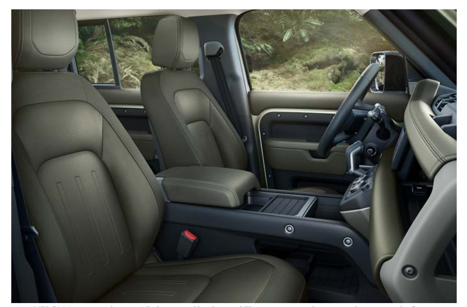
KHAKI/EBONY - Interior shown is Khaki grained leather and Ebony interior with cross car beam in Light Grey Powder Coat Brushed finish.