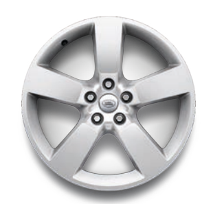
20" STYLE 5098, 5 SPOKE GLOSS SPARKLE SILVER