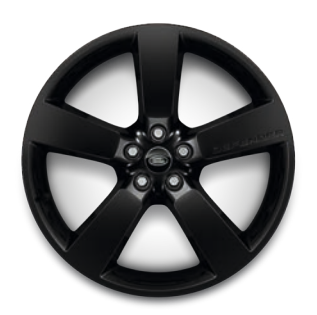
22" STYLE 5098, 5 SPOKE GLOSS BLACK All-season tyres