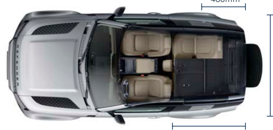
Lenath behind first row 1,313mm