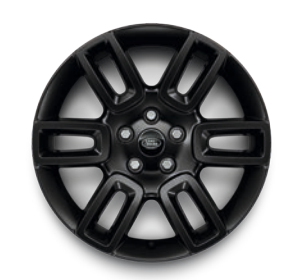
19" STYLE 6010, 6 SPOKE GLOSS BLACK