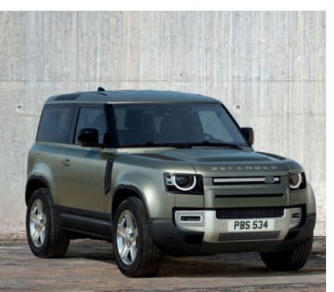
DEFENDER 90 SE - $117,900

Configure your Defender at landrover.co.nz