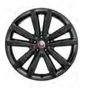
20" 5 SPLIT SPOKE 'STYLE 5051'