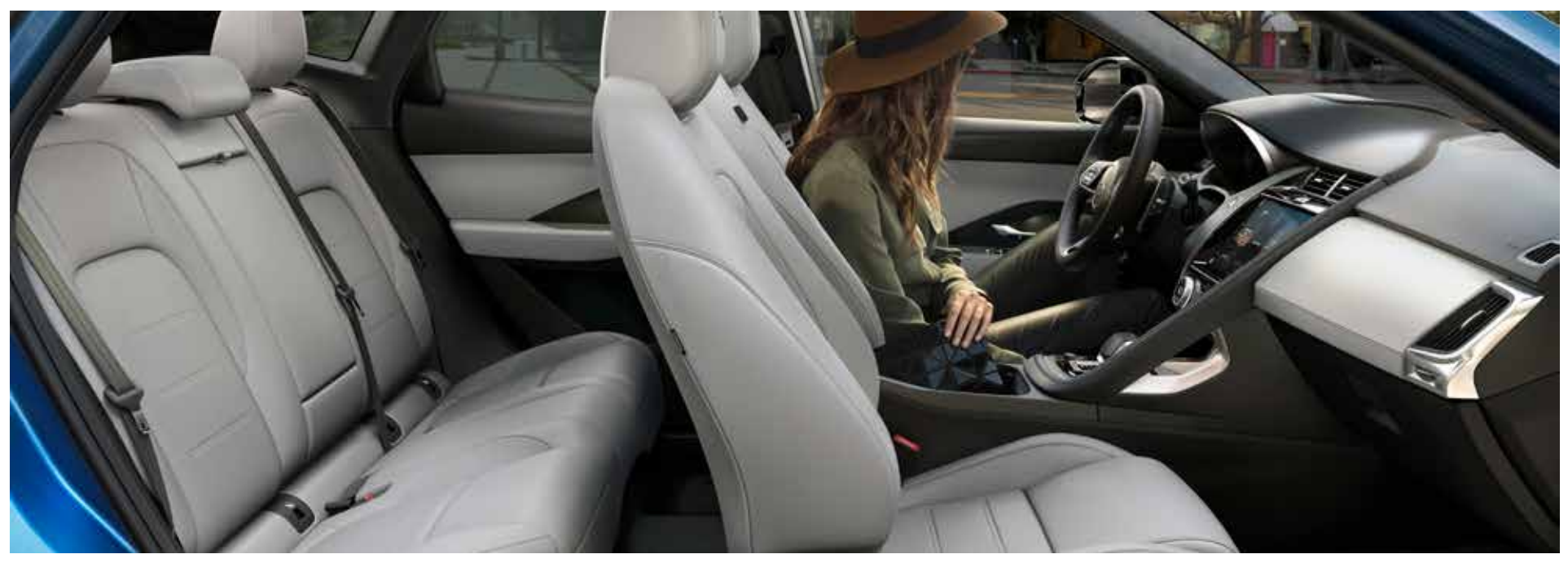
E-PACE R-Dynamic Interior Shown: Cloud Grained Leather Sport Seats