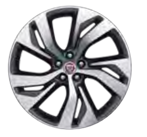
20" 5 SPLIT SPOKE 'STYLE 5120'