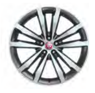
20" 5 SPLIT SPOKE 'STYLE 5051