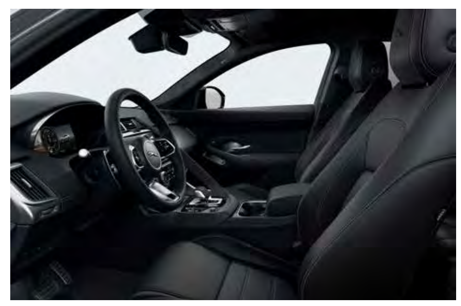
E-PACE R-Dynamic Interior Shown: Ebony Grained Leather Sport Seats