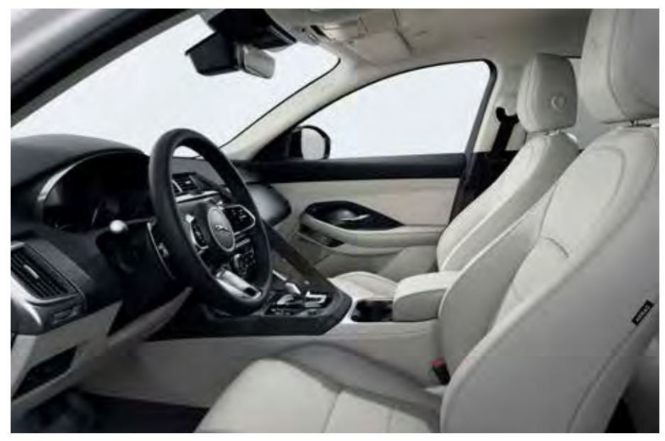
E-PACE R-Dynamic Interior Shown: Cloud Grained Leather Sport Seats