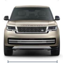
Front wheel track 1,702.3mm